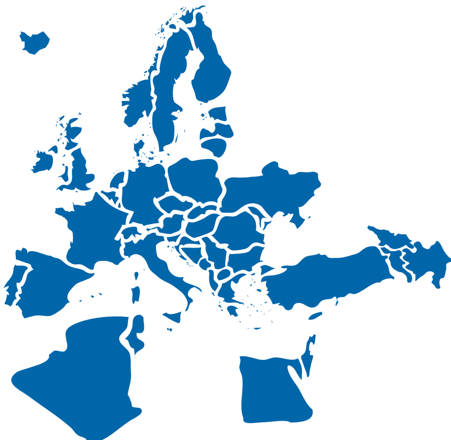
Map of MLA signatories in December 2025

Therefore, the marketplace can have confidence in activities of the EA MLA signatories and their accredited conformity assessment bodies. The EA MLA provides the European market with a network of conformity assessment bodies that are competent within their scope of accreditation to issue reliable and credible statements of conformity for products and services, thereby reducing costs and adding value to business and consumers. This contributes to the freedom of trade by eliminating technical barriers.