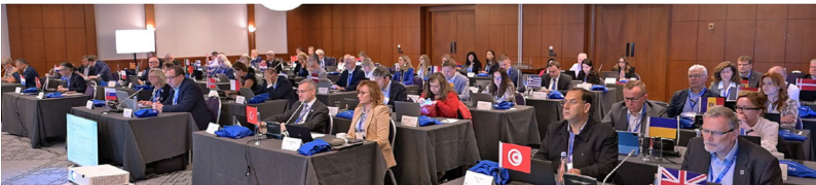
EA Multilateral Council Meeting - May 2025 - Tbilisi (Georgia)

ISAC, the Icelandic NAB, remained an EA MLA signatory in the field of inspection.