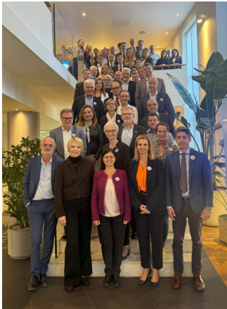
EA Multilateral Council Meeting - October 2025 - Brussels (Belgium)

UKAS, the British NAB, remained an EA MLA signatory in the fields of calibration, testing, including medical examinations, inspection, certification of management systems, certification of products, certification of persons, validation and verification, proficiency testing providers and reference material producers.